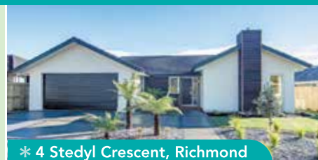
* 4 Stedyl Crescent, Richmond

2 & 4 Stedyl Crescent Richmond OPEN Monday to Friday 11.00am–4.00pm Saturday & Sunday 1.00pm–4.00pm