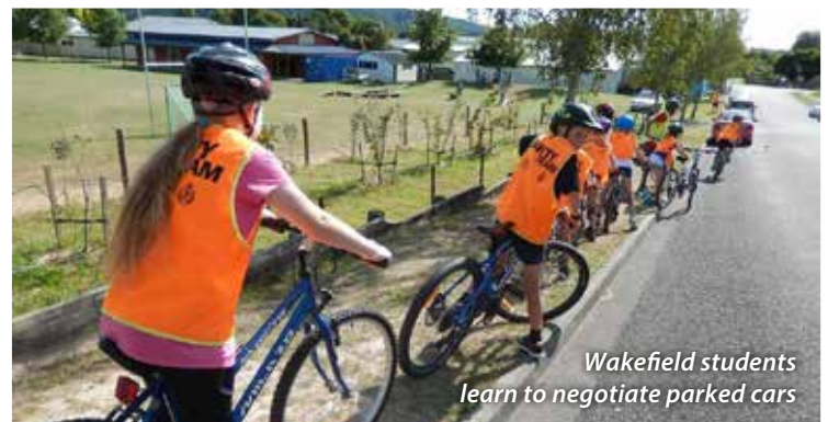
Wakefield students learn to negotiate parked cars

"I rode out with the team on several occasions and was immensely impressed by their knowledge, professionalism, humour and high standard of risk management. It's a terrific programme."