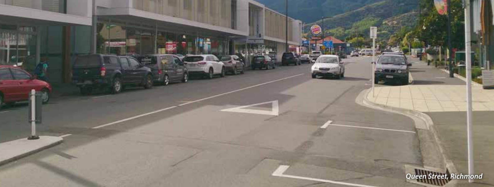
Queen Street, Richmond

Keeping you informed about news and events in Tasman District