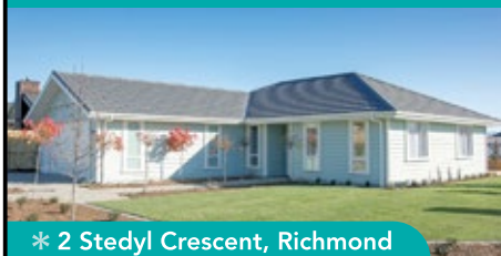
* 2 Stedyl Crescent, Richmond