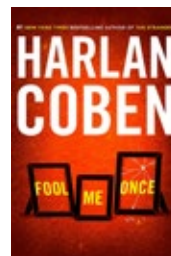
Fool me once by Harlan Coben