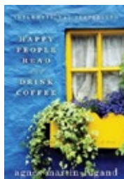
Happy people read and drink coffee by Agnes Martin-Lugand