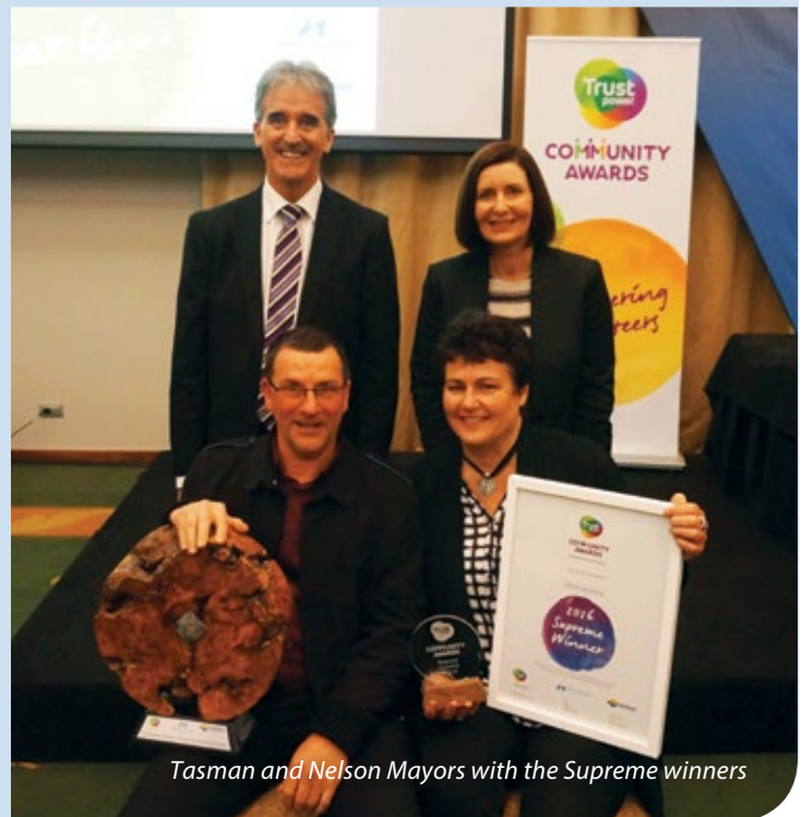
Tasman and Nelson Mayors with the Supreme winners