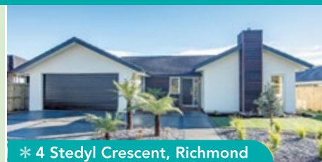
* 4 Stedyl Crescent, Richmond

2 & 4 Stedyl Crescent Richmond OPEN Monday to Friday 11.00am–4.00pm Saturday & Sunday 1.00pm–4.00pm