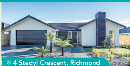
* 4 Stedyl Crescent, Richmond

* SHOWHOMES 2 & 4 Stedyl Crescent Richmond OPEN Monday to Friday 11.00am-4.00pm Saturday & Sunday 1.00pm-4.00pm