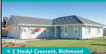
* 2 Stedyl Crescent, Richmond