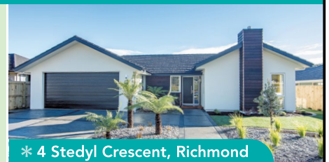
* 4 Stedyl Crescent, Richmond

2 & 4 Stedyl Crescent Richmond OPEN Monday to Friday 11.00am–4.00pm Saturday & Sunday 1.00pm–4.00pm