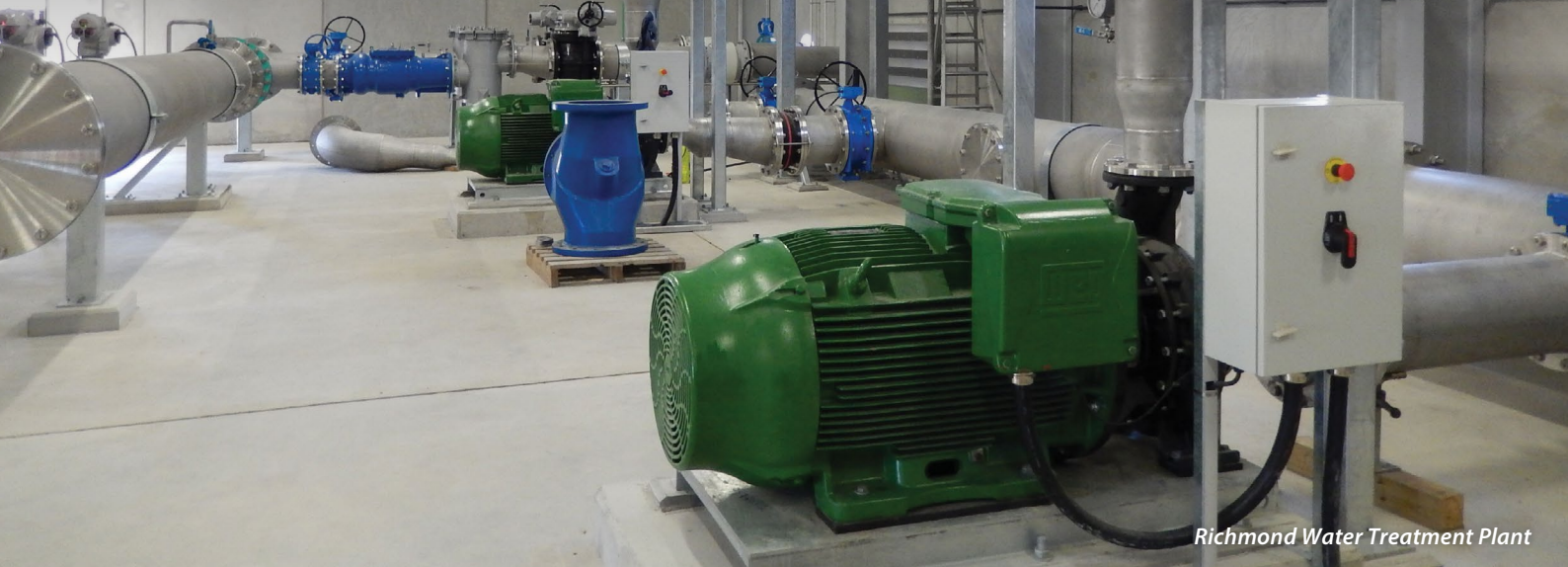
Richmond Water Treatment Plant

Keeping you informed about news and events in Tasman District