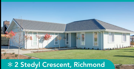
* 2 Stedyl Crescent, Richmond