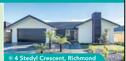
* 4 Stedyl Crescent, Richmond

* SHOWHOMES 2 & 4 Stedyl Crescent Richmond OPEN Monday to Friday 11.00am – 4.00pm Saturday & Sunday 1.00pm – 4.00pm