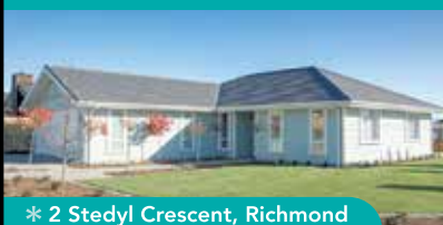
* 2 Stedyl Crescent, Richmond