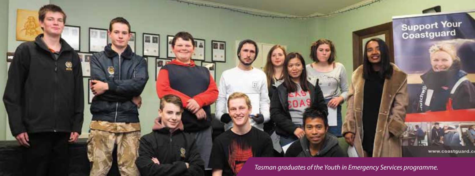
Tasman graduates of the Youth in Emergency Services programme.