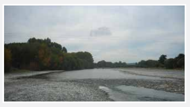
Above: The Waimea River with a flow rate of 800 litres per second – the target flow if there is no Waimea Community Dam.