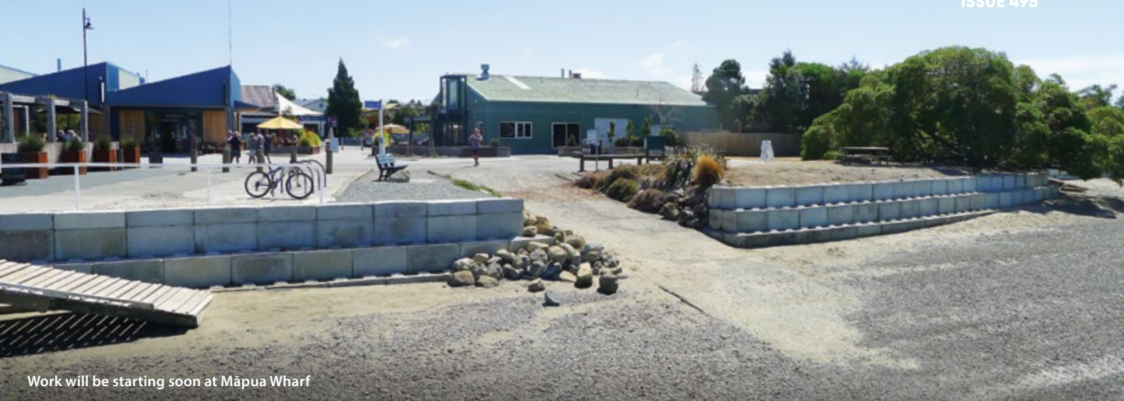
Work will be starting soon at Māpua Wharf