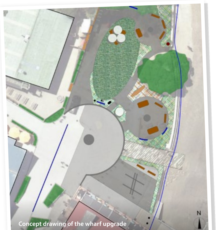
Concept drawing of the wharf upgrade

Because the area is a significant archaeological site, a heritage plan is in place and ground disturbance will be kept to a minimum. The work will be carried out in stages to reduce the area closed to the public and minimise disruption for neighbouring businesses.