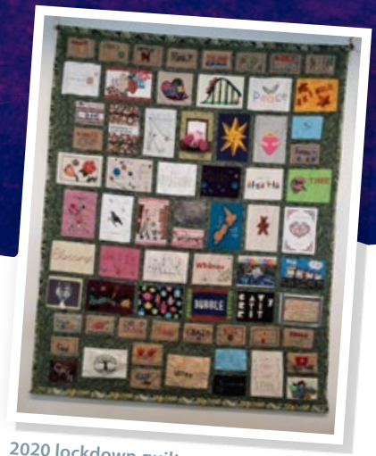
2020 lockdown quilt