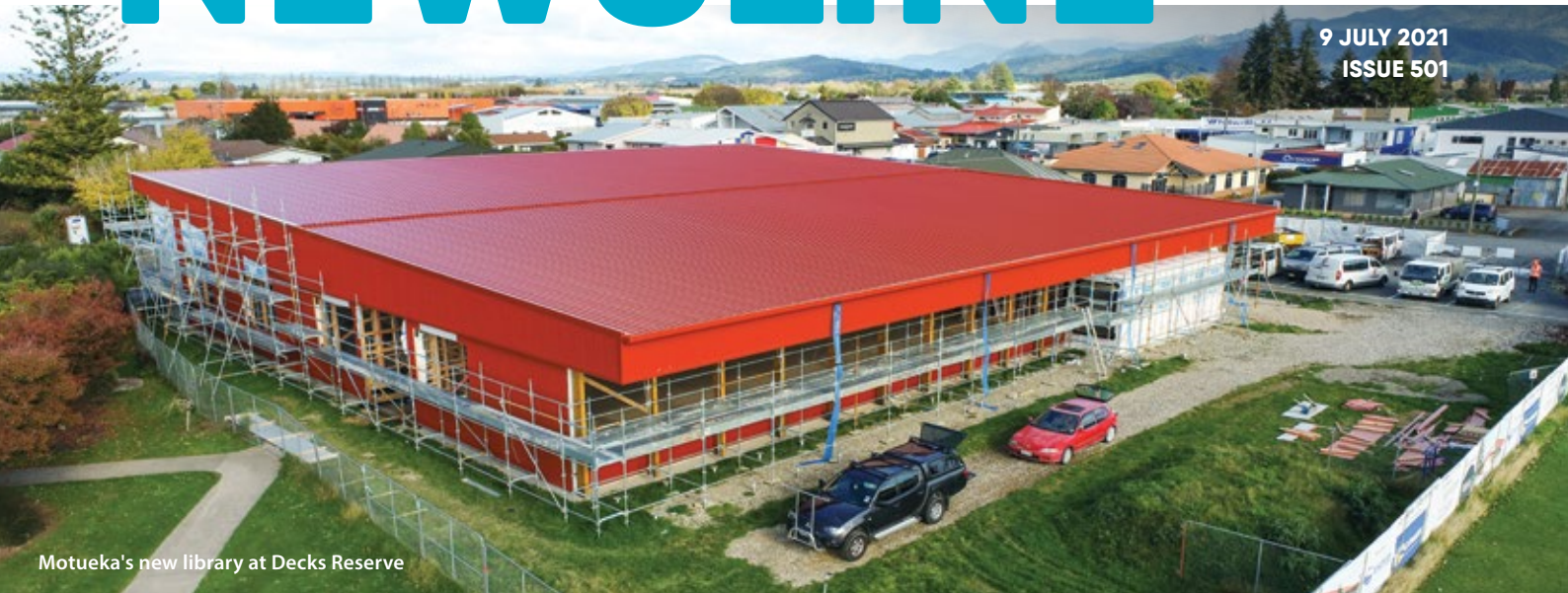
Motueka's new library at Decks Reserve