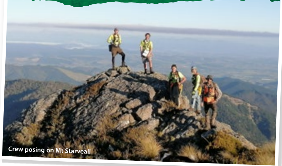
Crew posing on Mt Starveall

In the 12 months to March 31 2022, the project has employed five full-time equivalent workers through Jobs For Nature funding, with many more employed across the wider project.