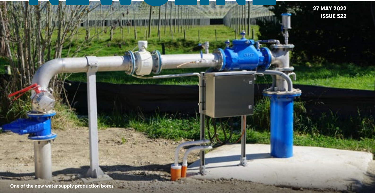
One of the new water supply production bores