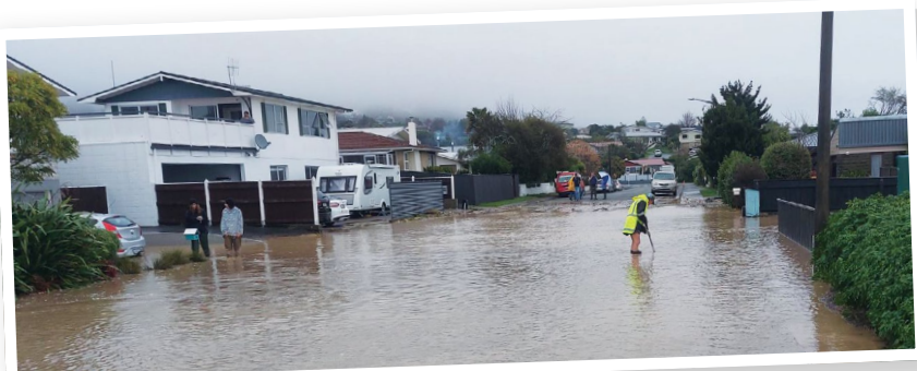
Corner of Selbourne Avenue, Richmond

All donations are eligible for a donation tax credit.