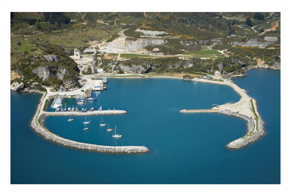
28th November 2013

Feedback on TDC's Fees and Charges (Development Plan)