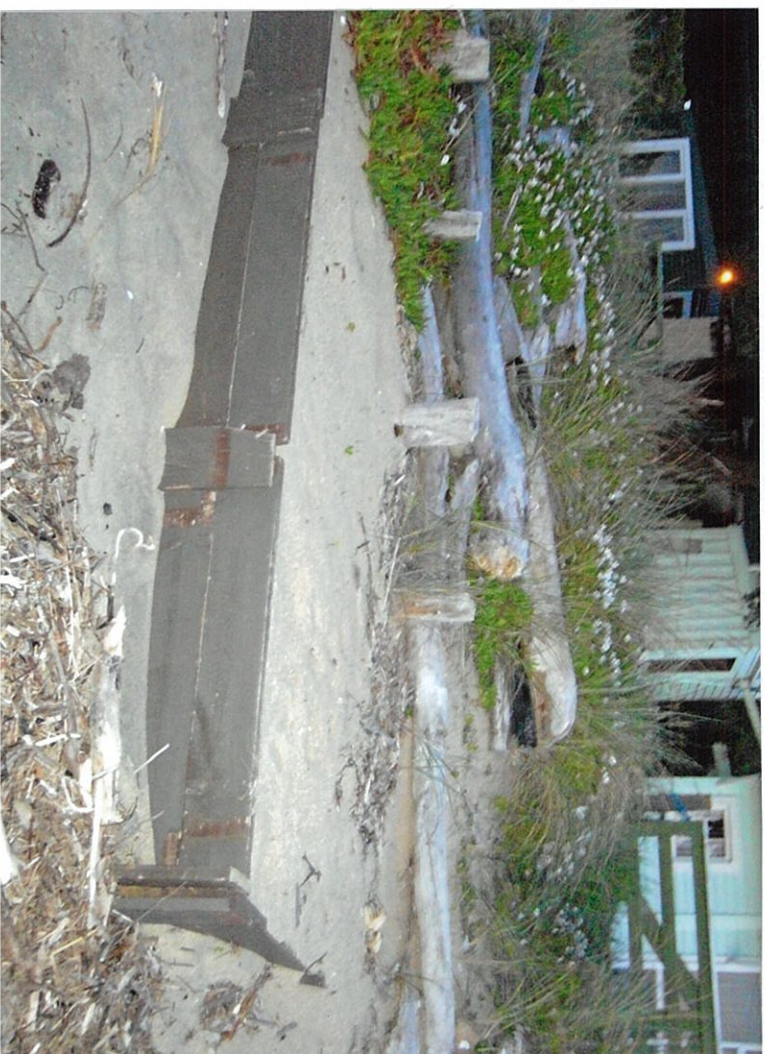
Below – Photo 3. Retaining to extend the beach boundary. Iconic Baches? NO!