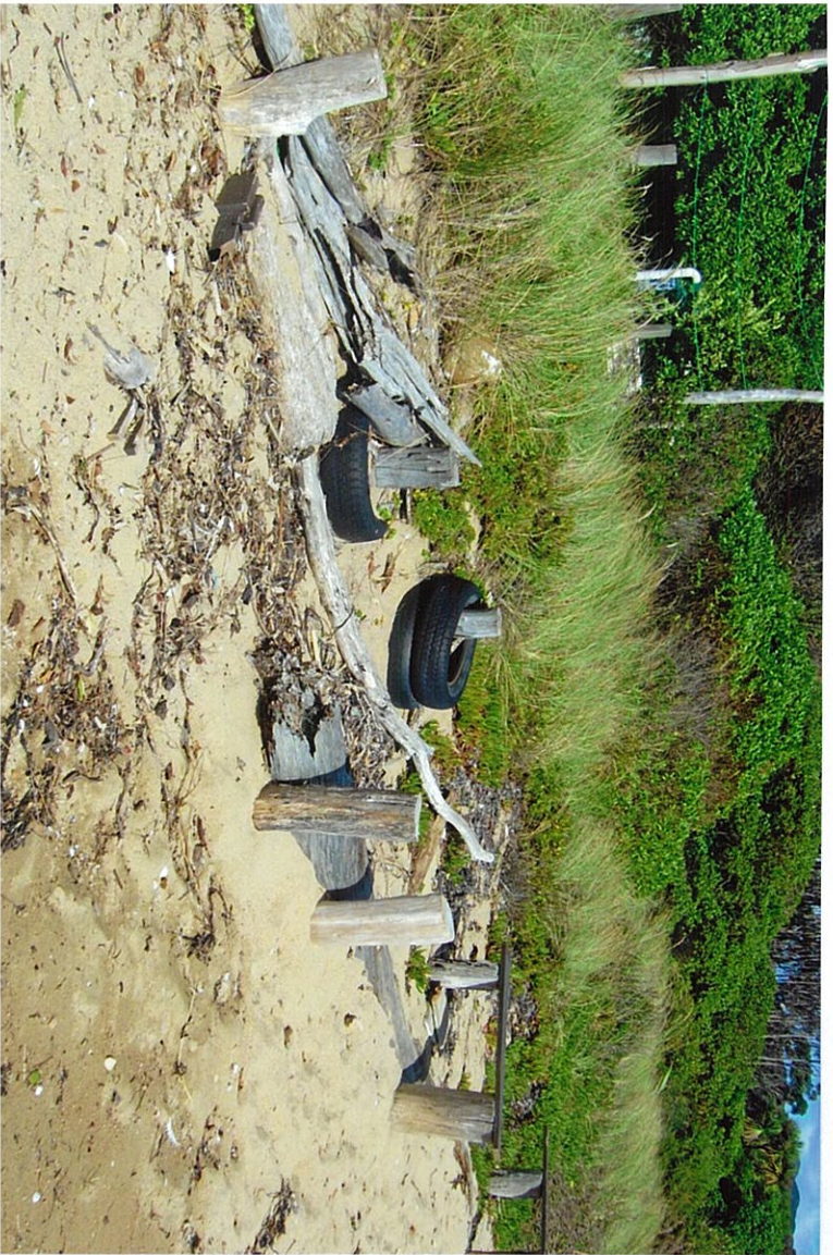
Below Photo 2. Note the seats on the right side of the picture. Old tyres & timber retaining.