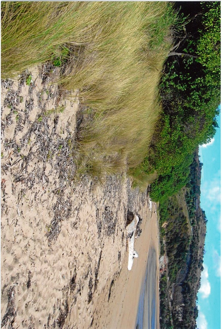
Photo 1. This is how the beach should look for its entire length