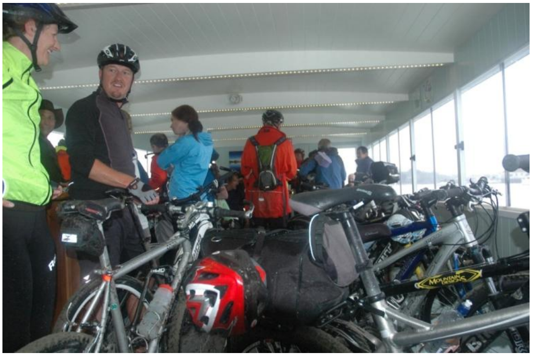
A full complement of cyclists cross the Mapua Channel in the "Fairy"

1.2 A successful open day and blessing for the launch of the "Flat Bottom Fairy" was held on 2 October. Sarah Ulmer (New Zealand Cycle Trail Ambassador) carried out the official launch and travelled on the ferry with Mayor Kempthorne other dignitaries across to Rabbit Island.