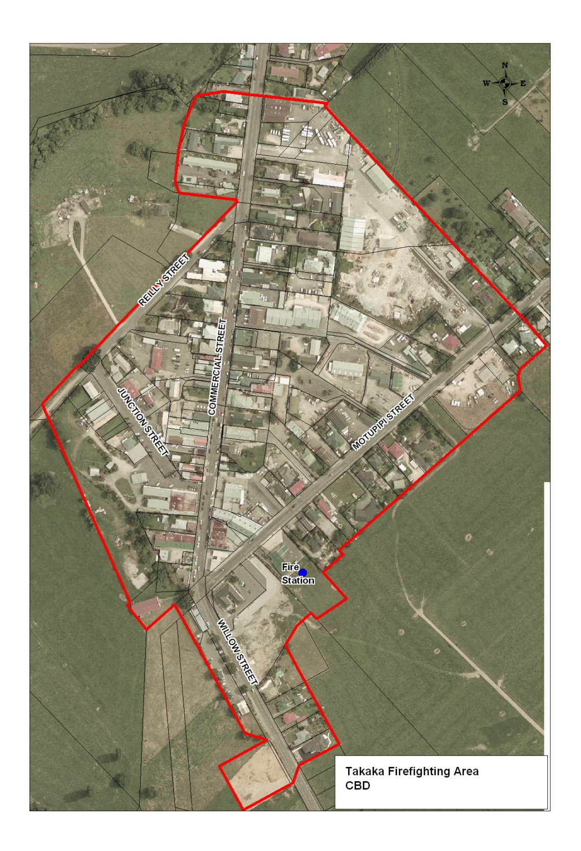
Figure 4-1: Takaka CBD as Defined in Workshop