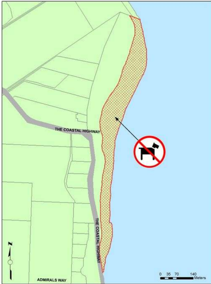
Dog Prohibited Area (Mckee Memorial Domain)