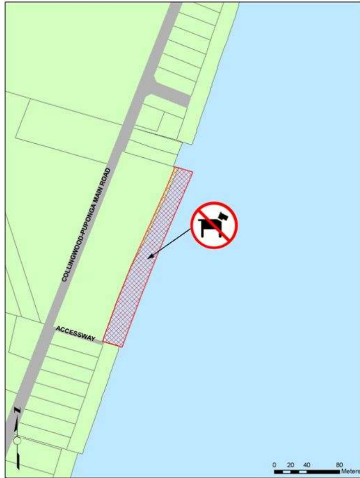
Dog Prohibited Area (Pakawau Beach - Camp Frontage) During summer months 1st December to 1st March