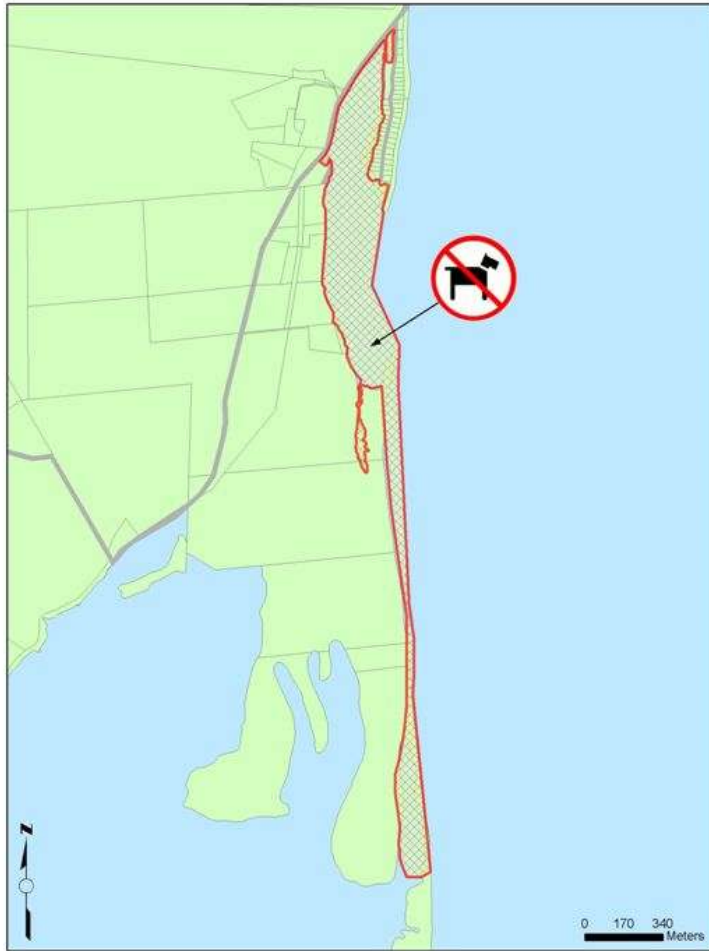
Dog Prohibited Area (Waikato Inlet - Beach to Ruataniwha Inlet)