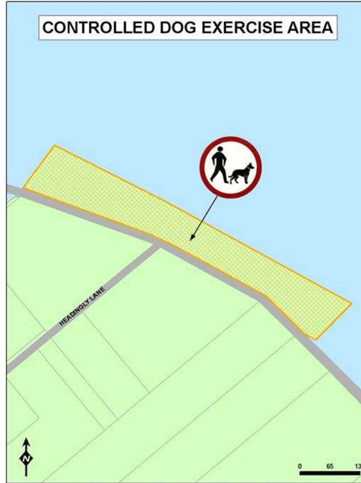
Headingly Lane (Mudflat Area below high tide mark)