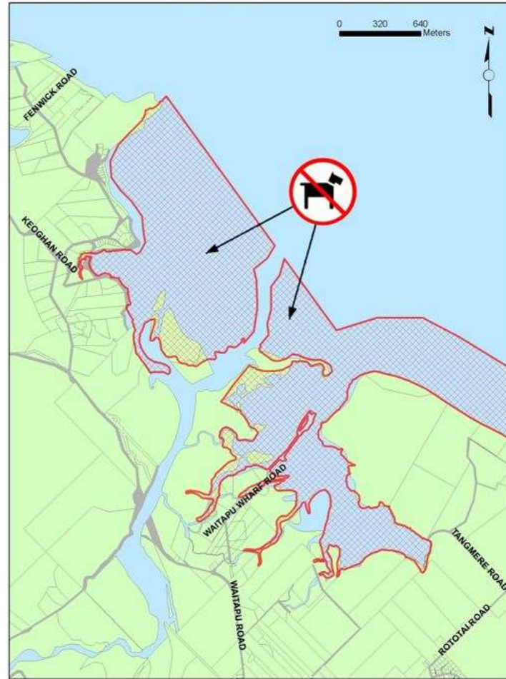
Dog Prohibited Area (Waitapu Estuary)