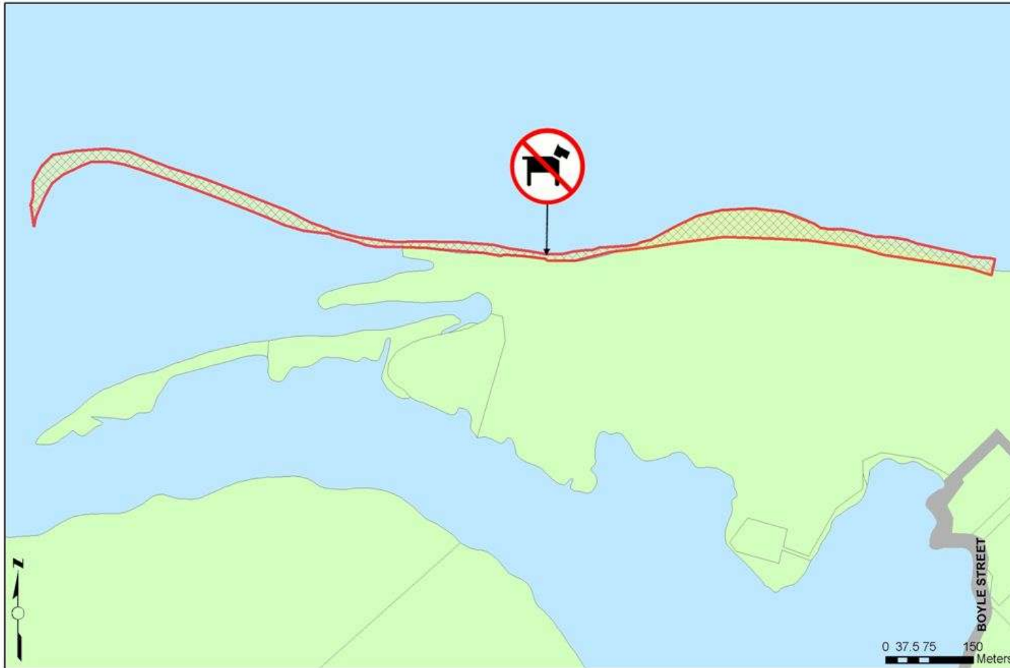
Dog Prohibited Area (Pohara Beach To Motupipi Estuary mouth)