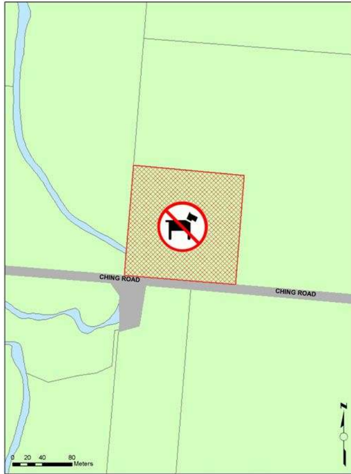
Dog Prohibited Area (Lower Moutere Recreation Reserve)

During summer months 1st December to 1st March - except between 05:00am and 09:00am