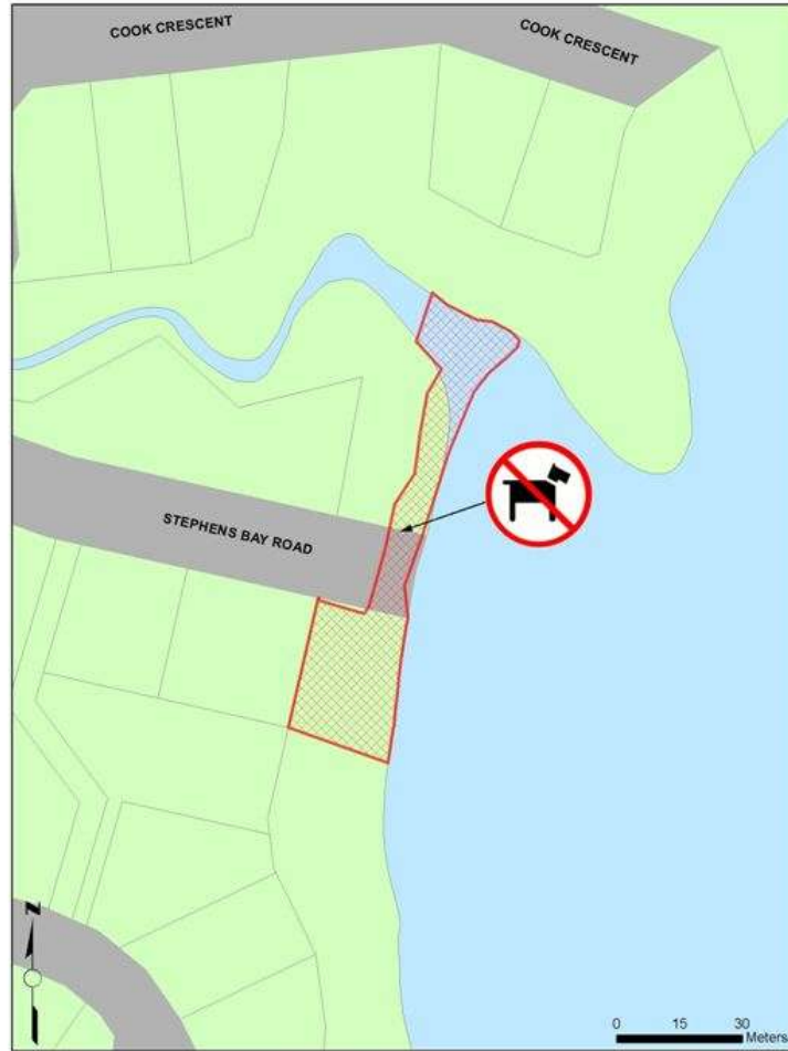
Dog Prohibited Area (Stephens Bay Beach)

During summer months 1st December to 1st March - except between 05:00am and 09:00am