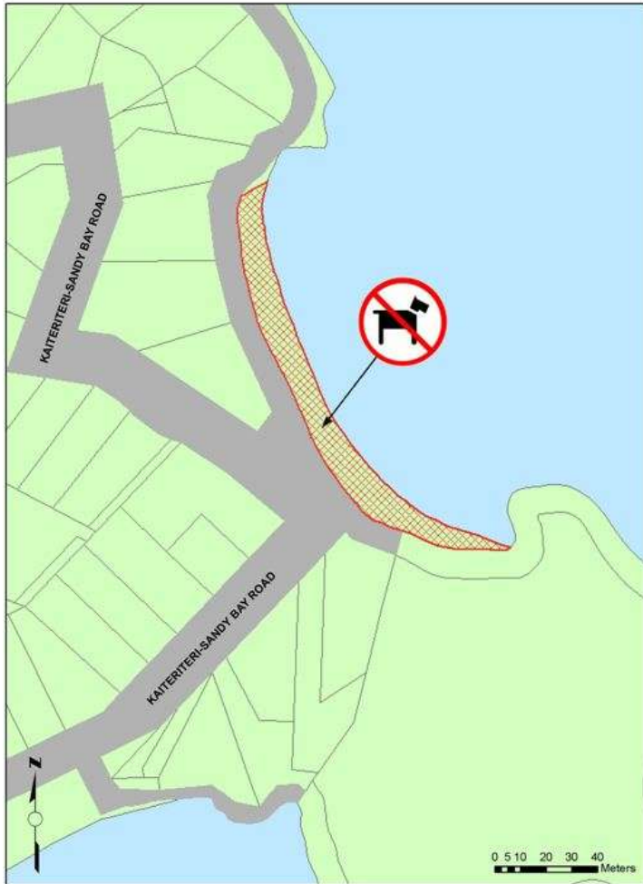
Dog Prohibited Area (Breaker Bay Beach)