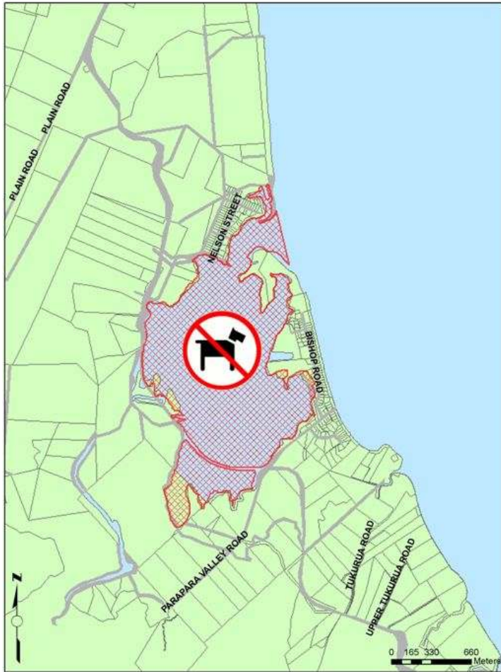
Dog Prohibited Area (Parapara Inlet)