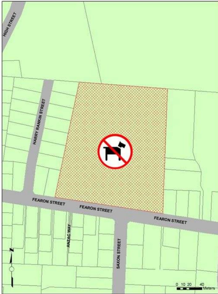
Dog Prohibited Area (Fearon Bush Camping Ground)