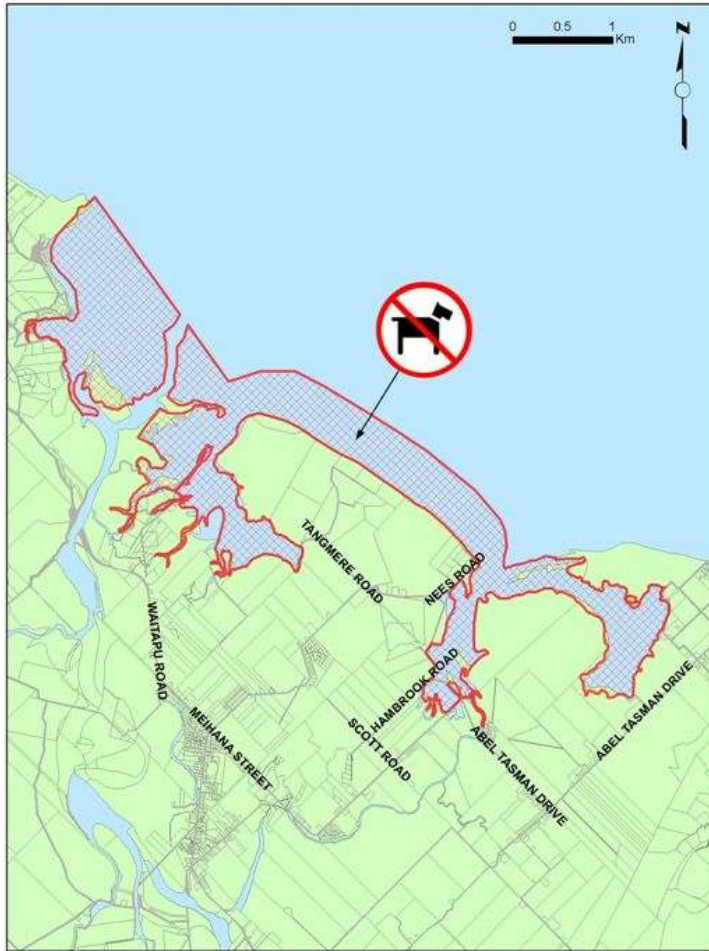
Dog Prohibited Area (Rototai to Waitapu Estuary)