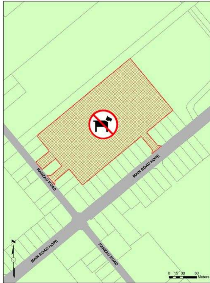
Dog Prohibited Area (Hope Recreation Reserve and Hall)