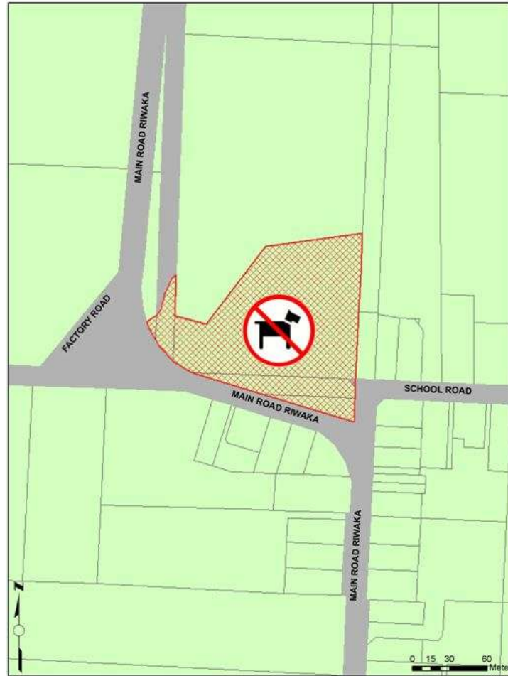
Dog Prohibited Area (Memorial Reserve Corner, Riwaka)