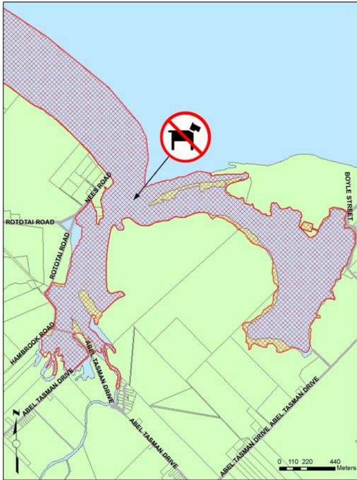
Dog Prohibited Area (Motupipi Estuary) Excluding designated dog exercise area