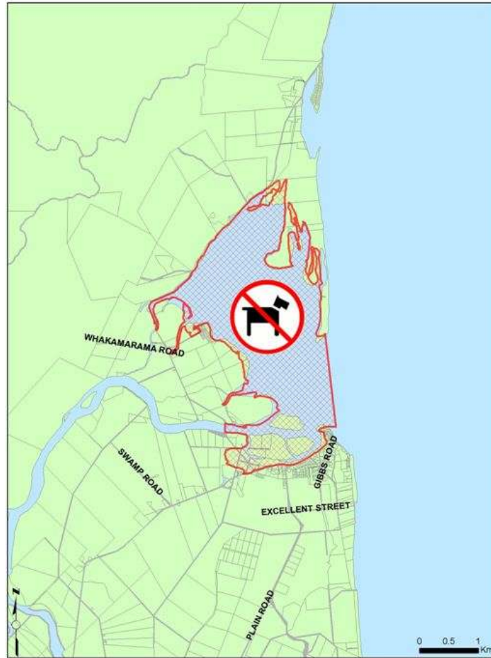
Dog Prohibited Area (Ruitaniwha Inlet)