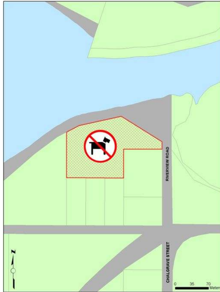
Dog Prohibited Area (Riverview Motor Camp - Murchison)