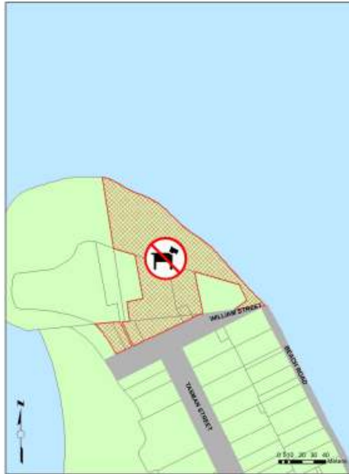
Dog Prohibited Area (Collingwood Camping Ground) During summer months 1st December to 1st March