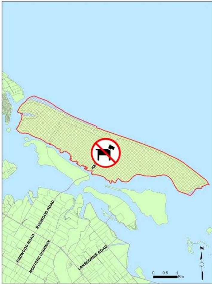
Dog Prohibited Area (Rabbit Island and beach)