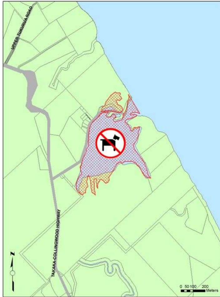
Dog Prohibited Area (Onekaka Estuary)