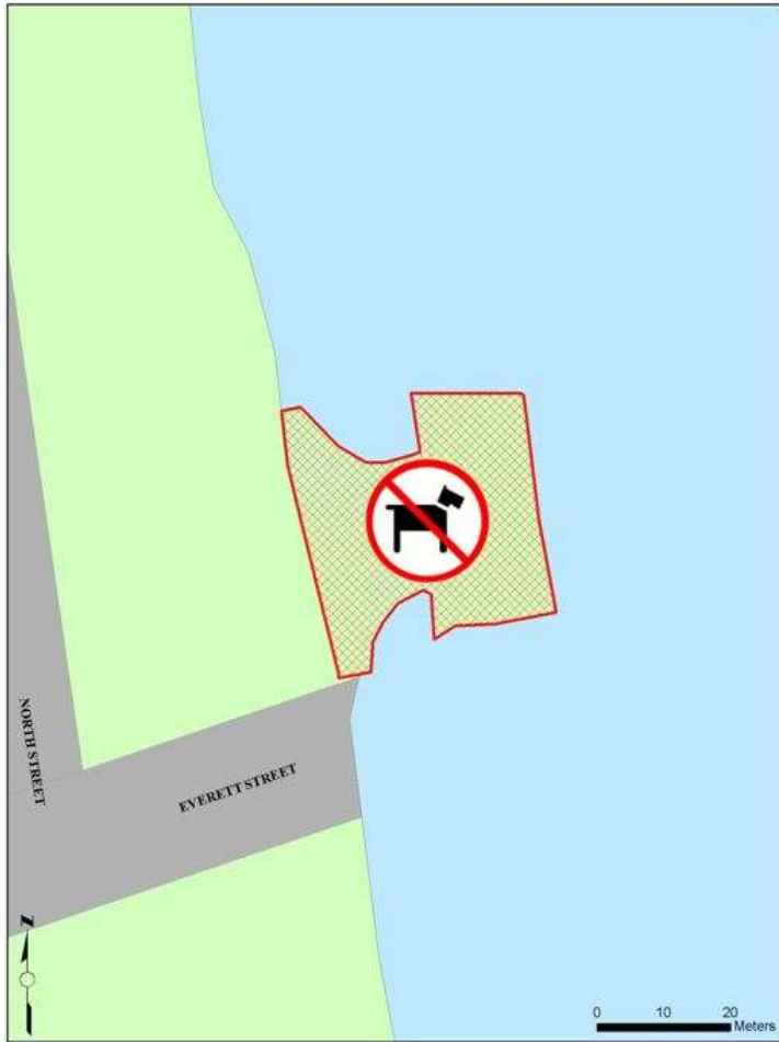
Dog Prohibited Area (Saltwater Baths - Motueka)