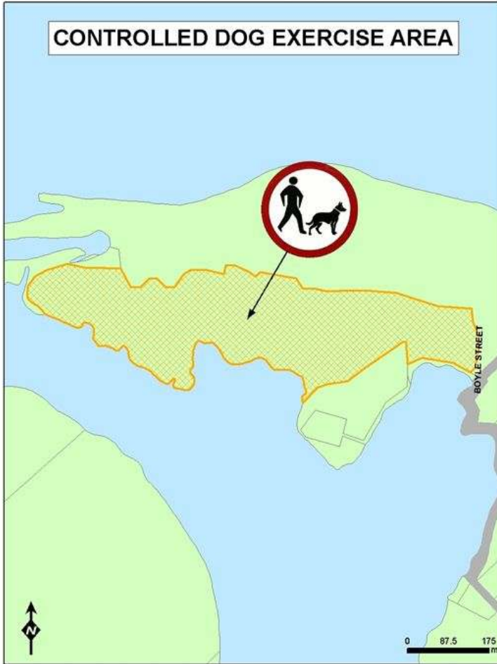
Motupipi Estuary (Between cemetery & golf course)