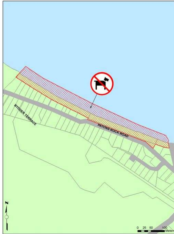
Dog Prohibited Area (Patons Rock Beach - In front of the settlement)

During summer months 1st December to 1st March