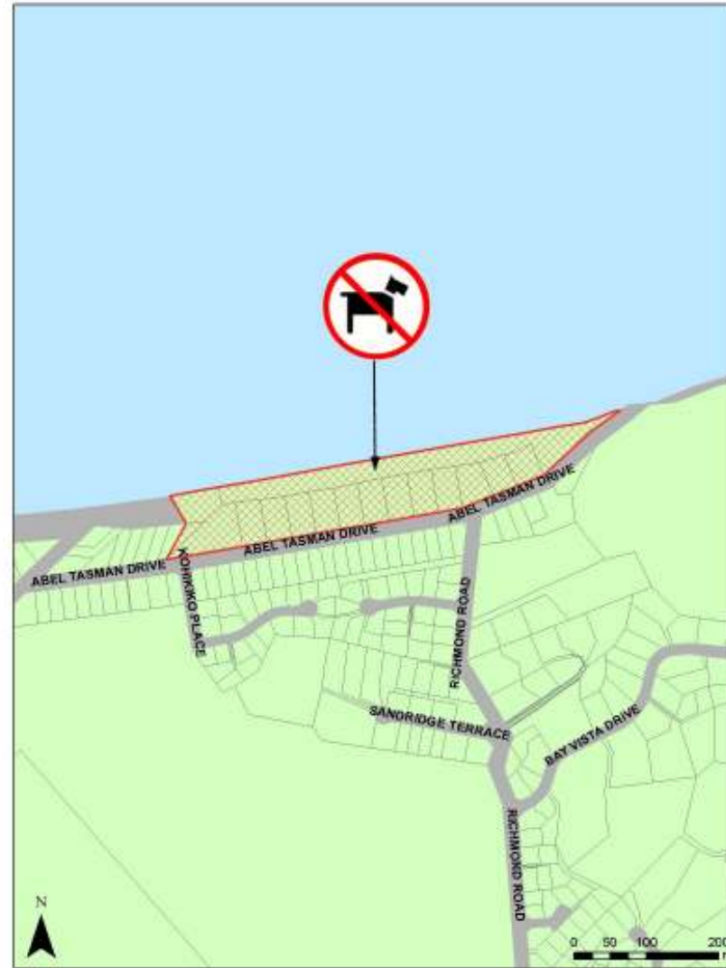
Dog Prohibited Area (Pohara Beach Top 10 Holiday Park)

During summer months 1st December to 1st March