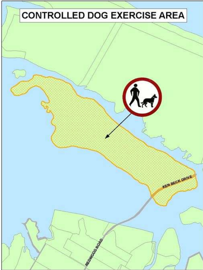
Rough Island (Hunter Brown & Greenslade Park)