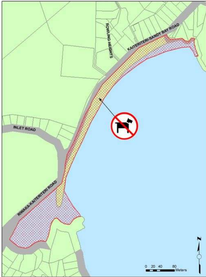
Dog Prohibited Area (Kaiteriteri Beach)