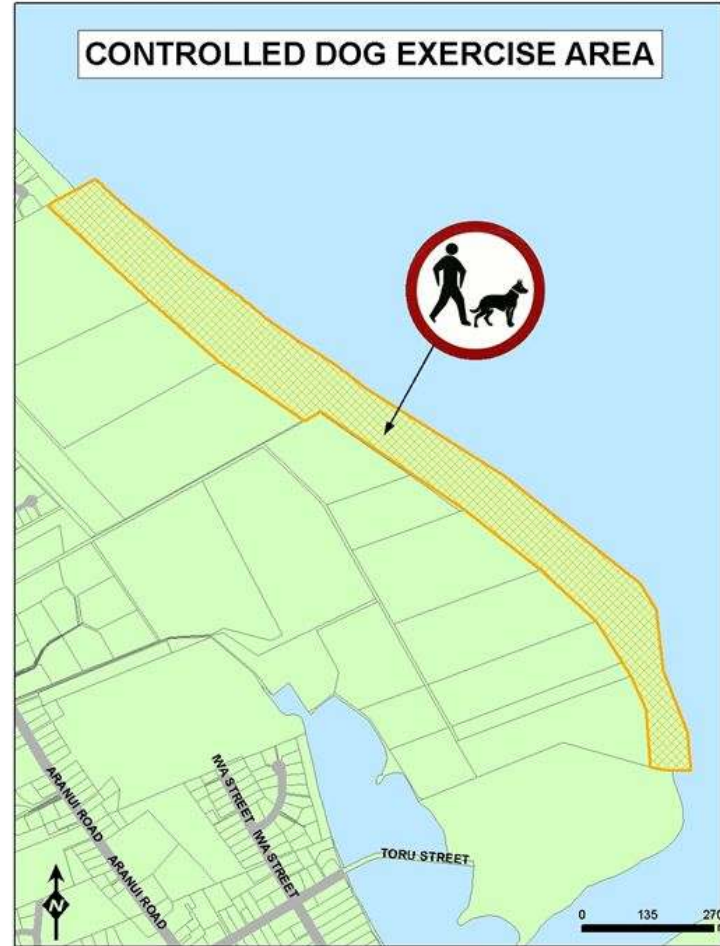
Old Mill Walkway (Foreshore from Mapua Leisure Park to Chayter Reserve)