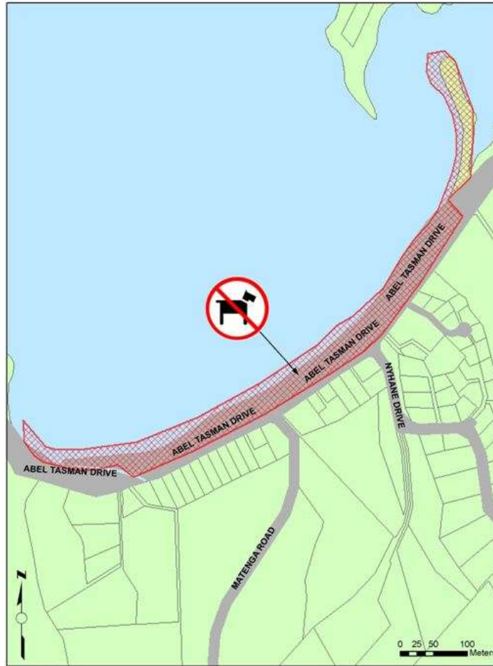
Dog Prohibited Area (Ligar Bay Beach)

During summer months 1st December to 1st March - except between 05:00am and 09:00am