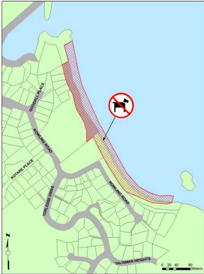
Dog Prohibited Area (Little Kaiteriteri Beach)

During summer months 1st December to 1st March - except between 05:00am and 09:00am