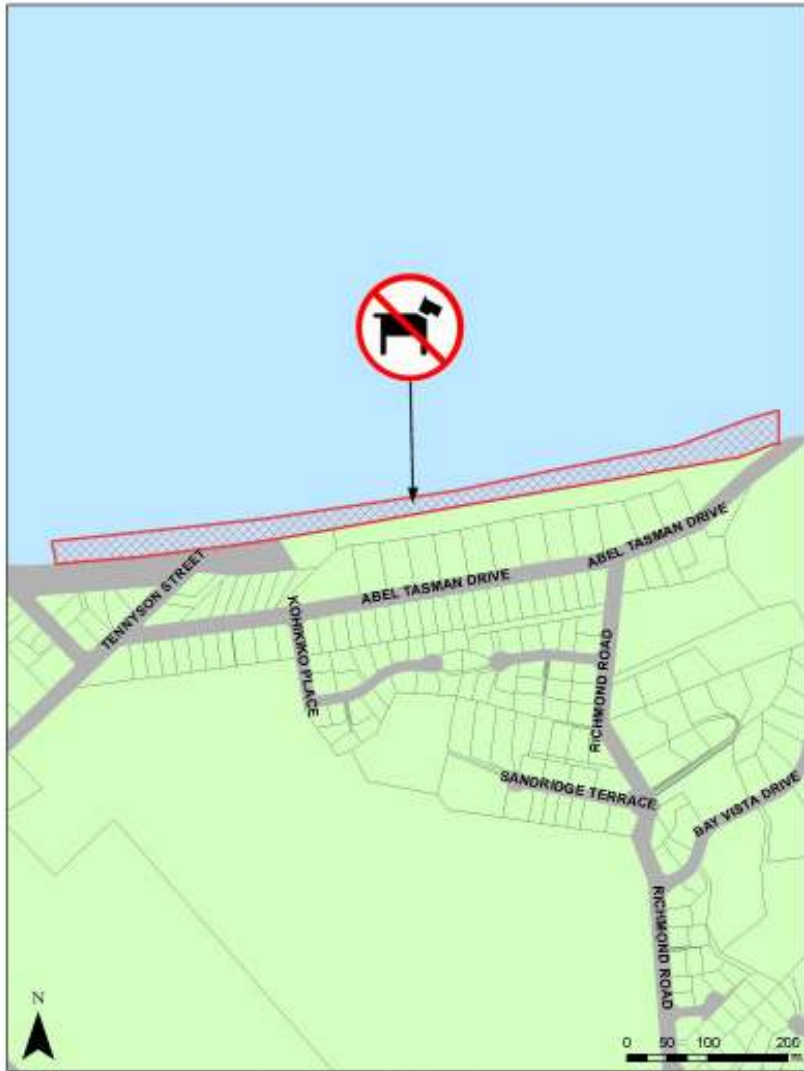
Dog Prohibited Area (Pohara Beach from eastern camp boundary to Selwyn St Reserve)

During summer months 1st December to 1st March