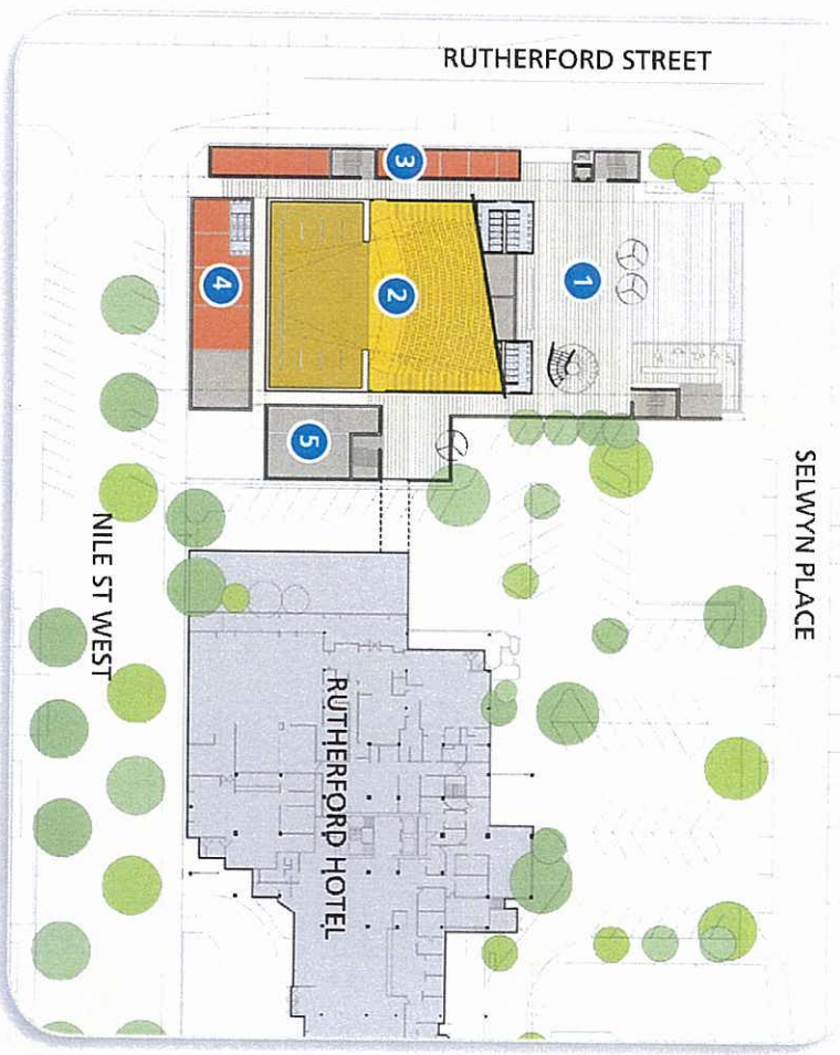
Proposed Performing Arts facility footprint - main entrance from Selwyn Place.