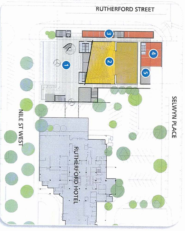
Proposed Performing Arts facility footprint - main entrance from Nile Street West.