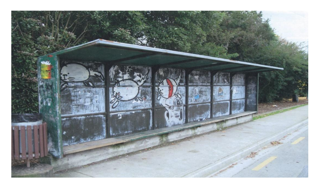
The following photo is of the same site after the community mural had been put up by the Pride of Place Project.