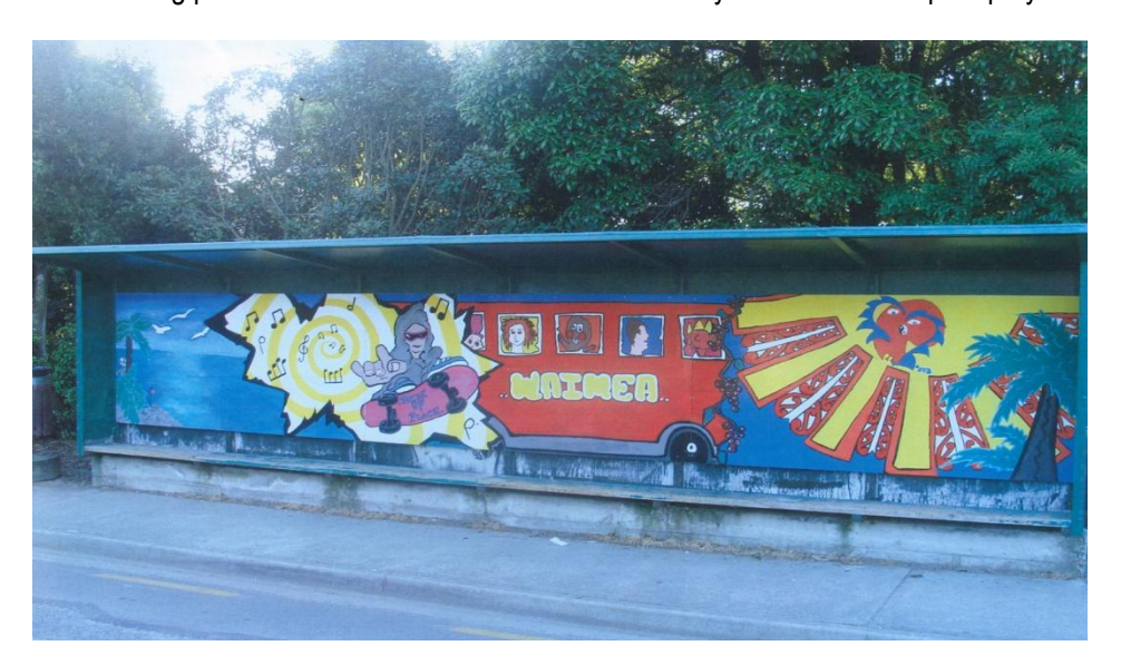
This next photo is of the same mural, several months later in June 2011, showing still no tagging or other vandalism of the mural.