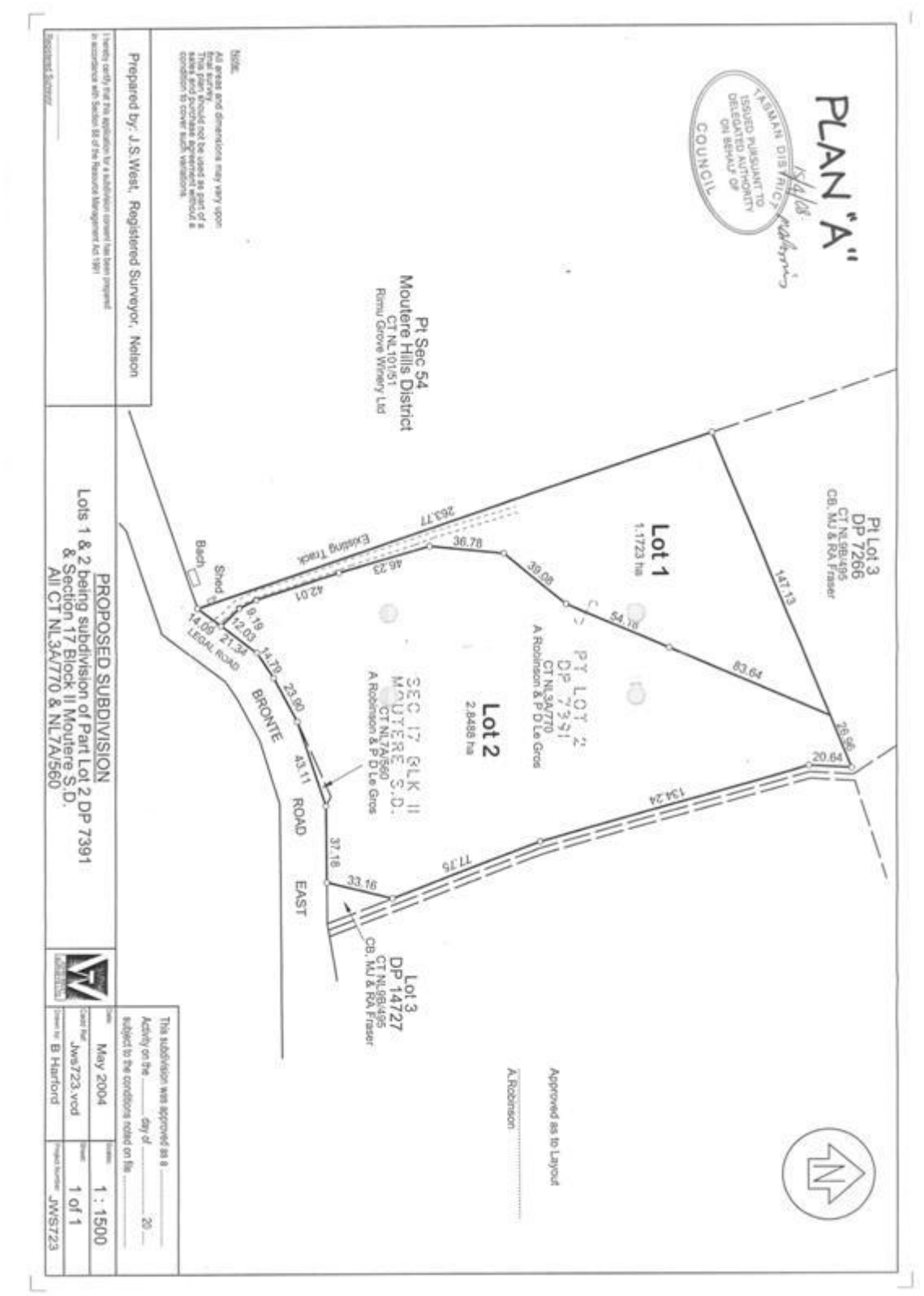
PLAN A RM070256