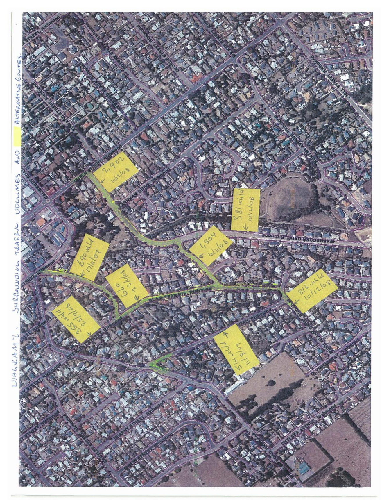
Alternative Vehicle Routes and Current Traffic Counts