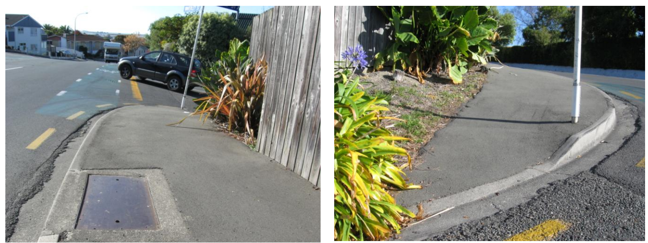
Looking back towards Richmond