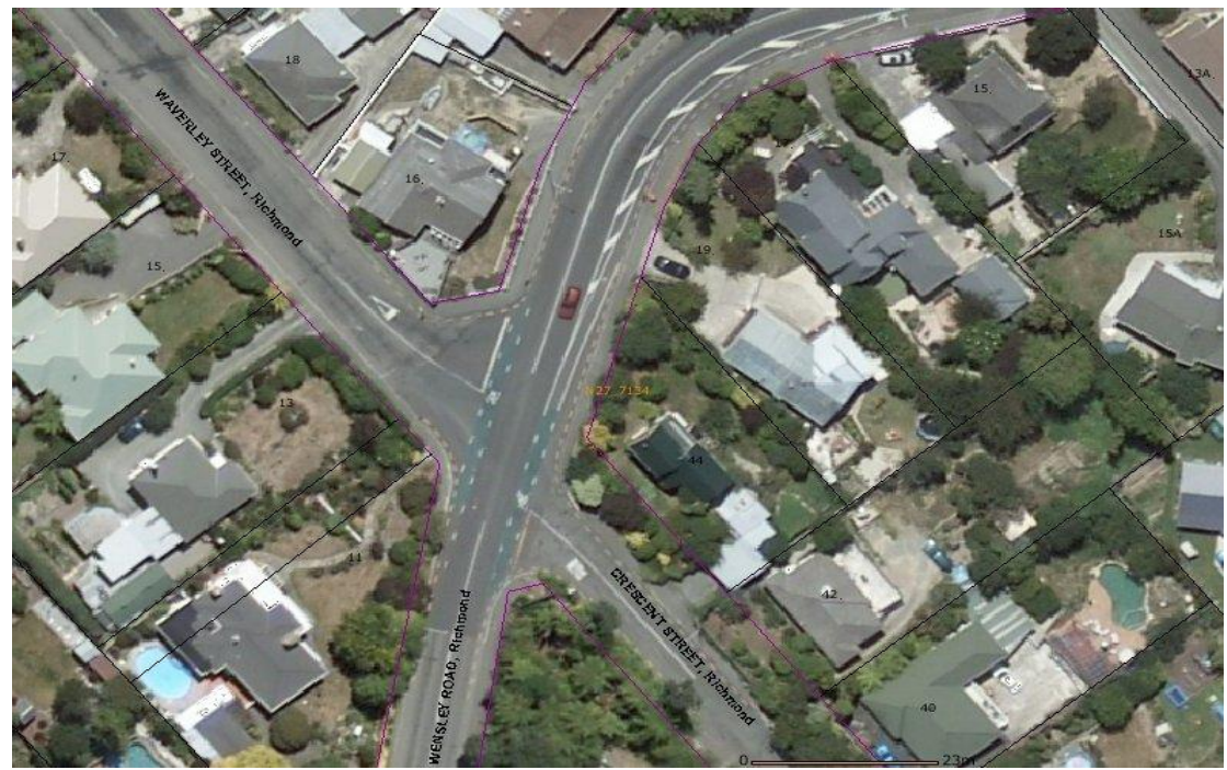
Wensley Road at Crescent Street