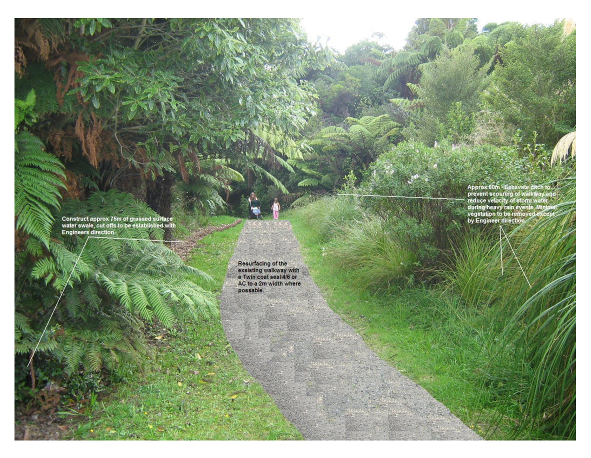
Steeper section – proposal to install seat in this area