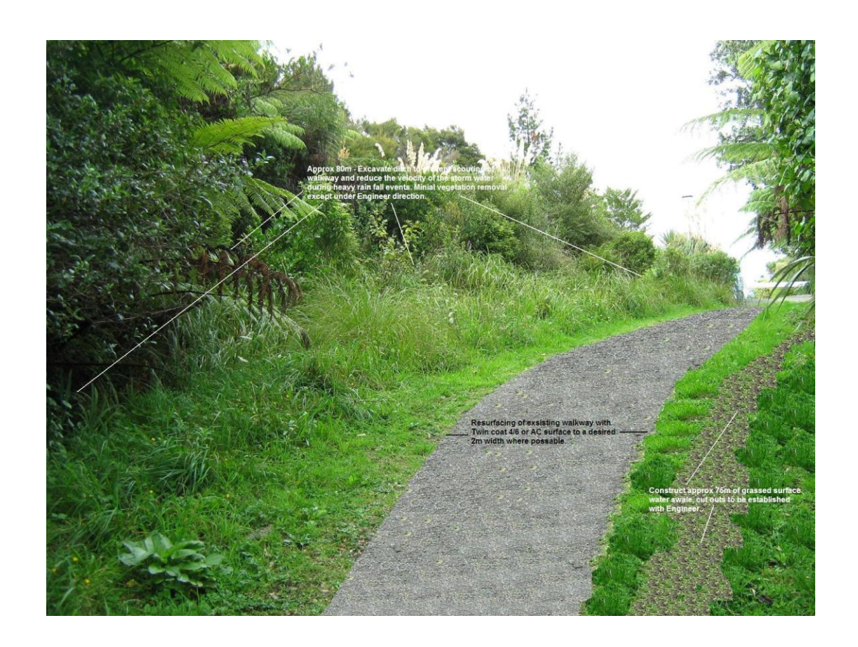
Looking up towards top of walkway