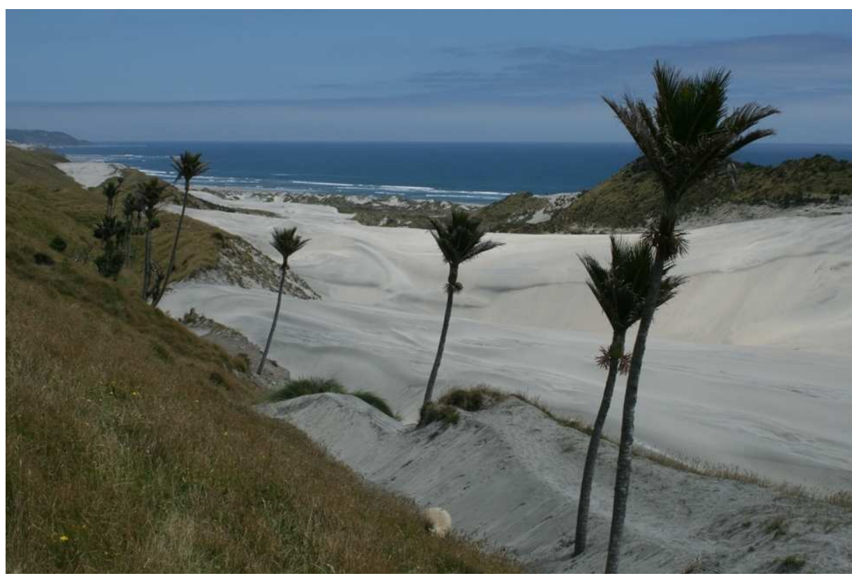
Turimawiwi sandhills, Golden Bay