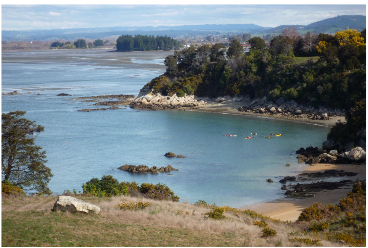
Stephens Bay, Kaiteriteri

Wharf Road esplanade reserve foreshore development ongoing work between 2012/2013 and 2014/2015.