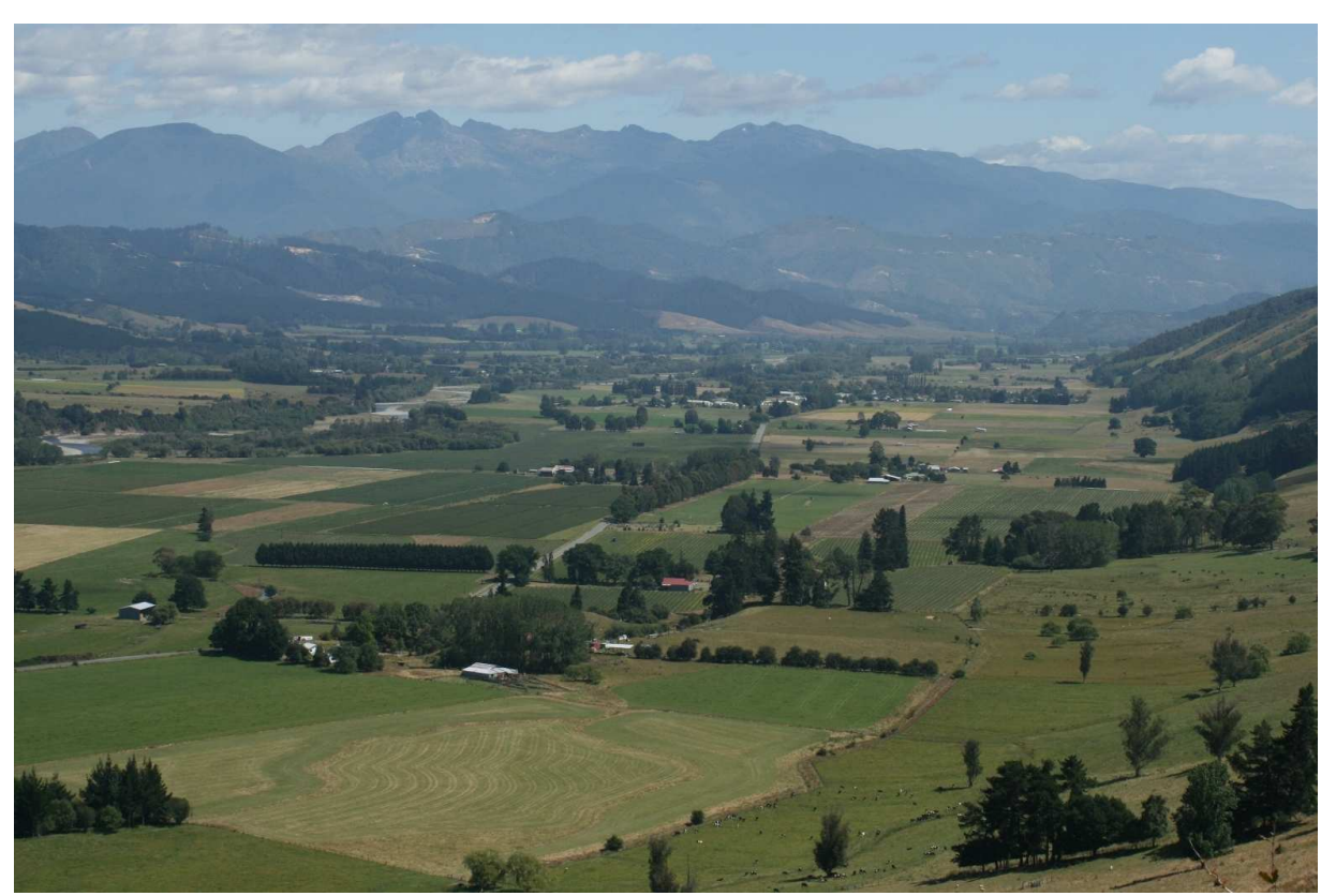
Motueka Valley and Tapawera