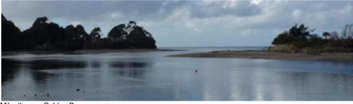
Milnethorpe, Golden Bay