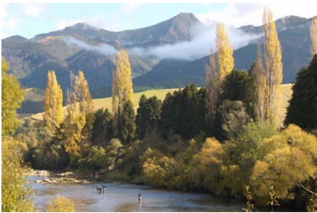
Fishing - Motueka River

For further details on the key changes, issues and uncertainties please refer to pages 21 – 30 of the Annual Plan 2011/2012.