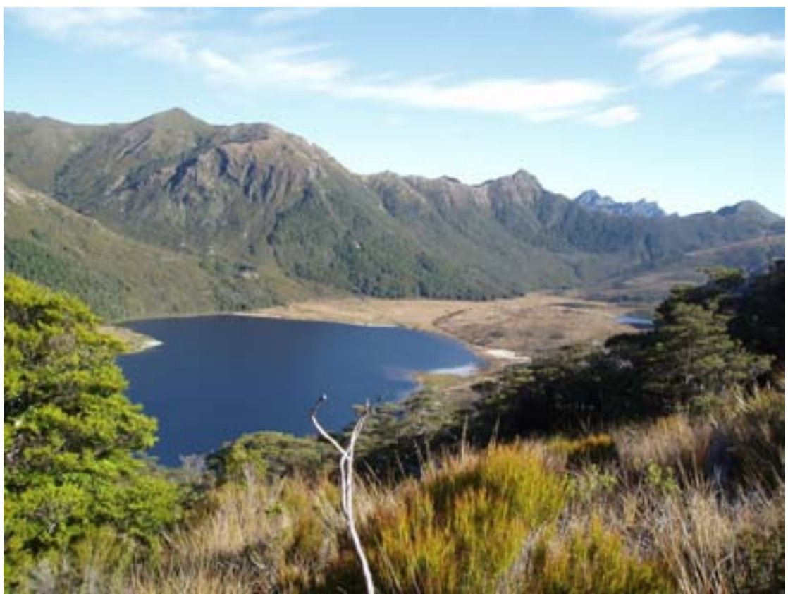
Dragons Teeth - Matiri