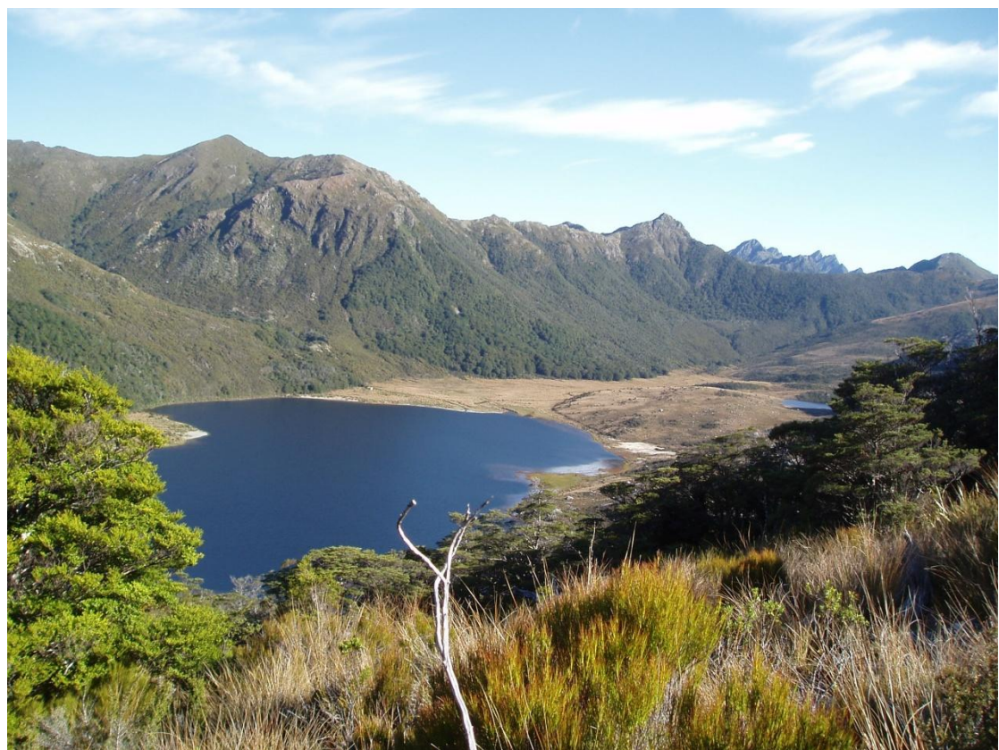
Dragons Teeth - Matiri