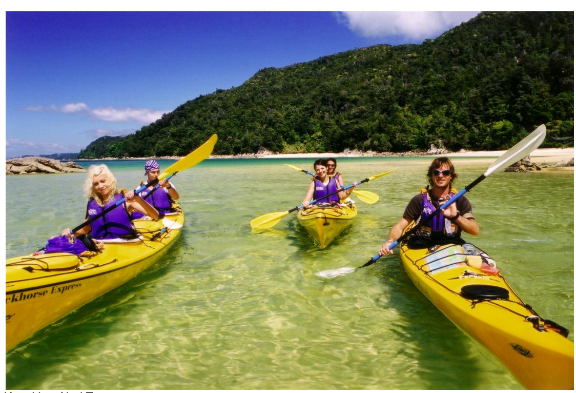
Kayaking Abel Tasman