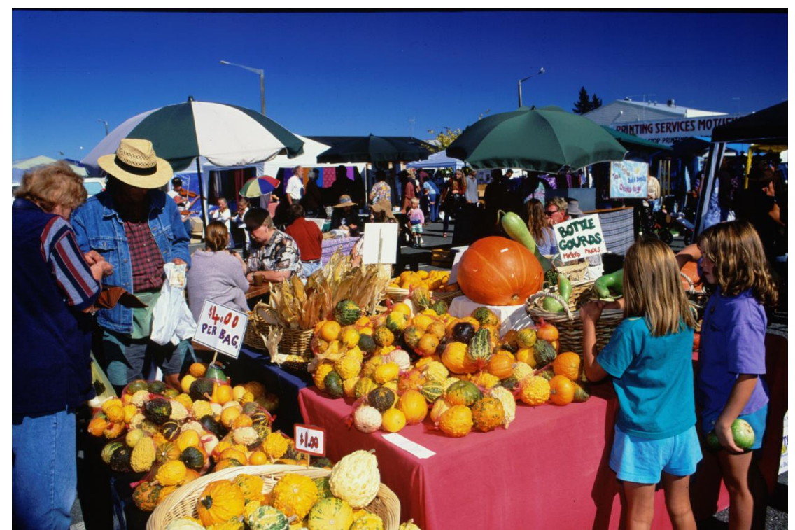
Motueka Sunday Market