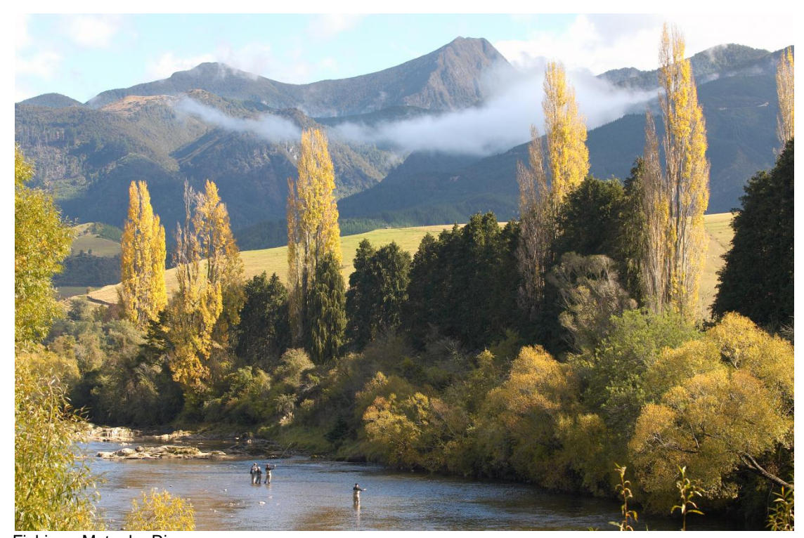
Fishing - Motueka River

For further details on the key changes, issues and uncertainties please refer to pages 21 – 30 of the Draft Annual Plan 2011/2012.