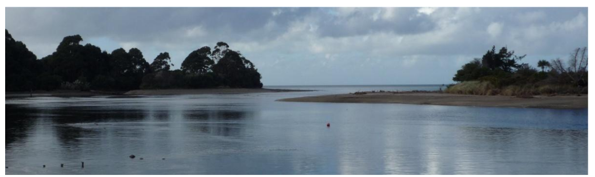
Milnethorpe, Golden Bay