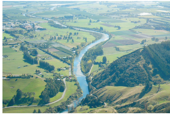
Looking out over the Wairoa Gorge - Waimea East Irrigation Intake in the foreground on the right